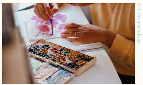
Water Rased Activities